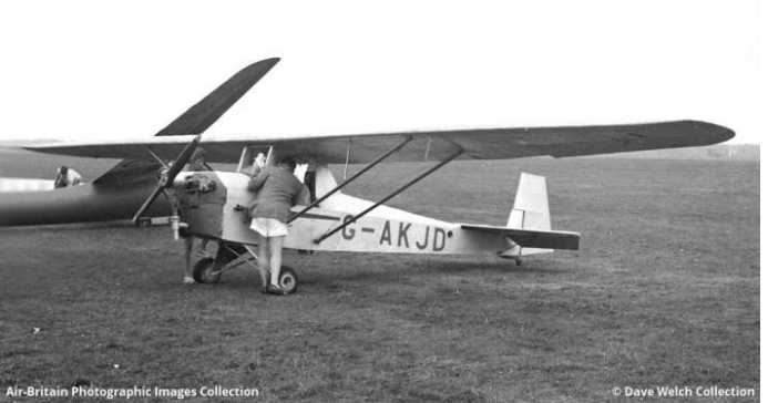
Dam a 1 to 1 scale model has already been built, and one of them has even got the same registration number. Looks like someone beat me to it by about 69 years. Nobody told me it was a Slingsby Kirby Motor Tutor. I would have recognised the Slingsby.

It just goes to show though, if you want to do your first scale model, maybe vintage could be the way to go.