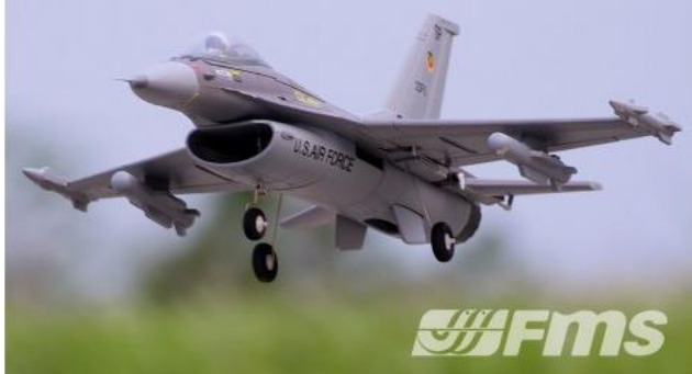
This is what it will look like.