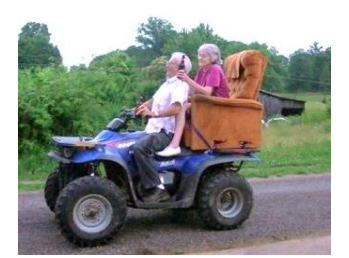
Life's still good in Mangawhai!

The spring has sprung, the grass has ris, I wonder where the dammed transmitter is.