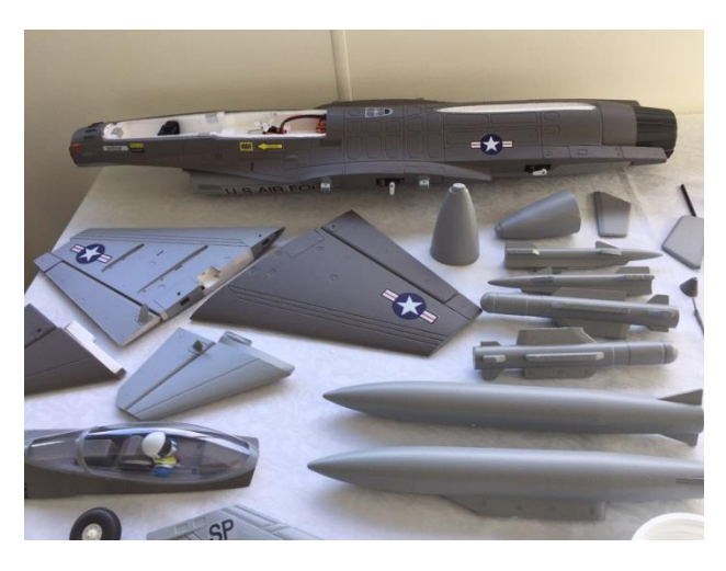
Wingspan: 780mm (30.7 in) Length: 1230mm (48.4 in) Flying Weight: 1000g (35.3 oz) 70mm Ducted Fan Outrunner Brushless Motor