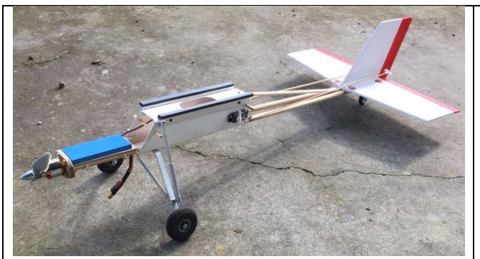
Das Stick Thing. Fly's well and very very robust.