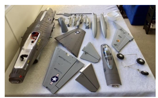
High speed, flying speed 120+ KPH.