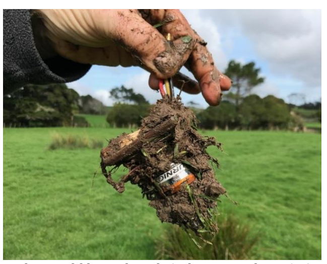
Who would have thought? This was only an 049 before it was planted at the end of last summer.